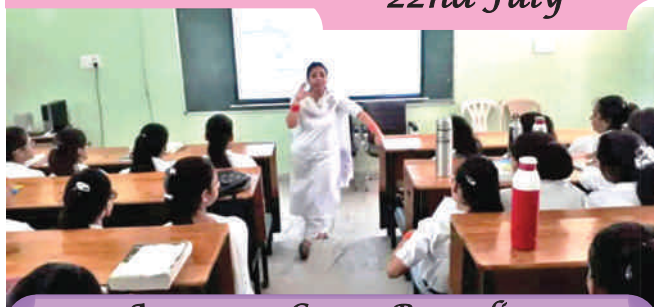
Awareness Camps Regarding Jal Shakti Abhiyan