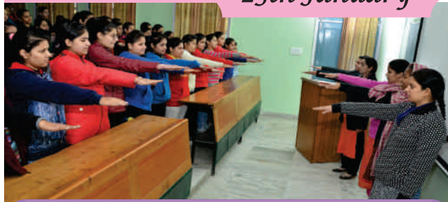
National Voters' Day Celebration