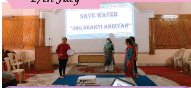
Street Play On Water Conservation