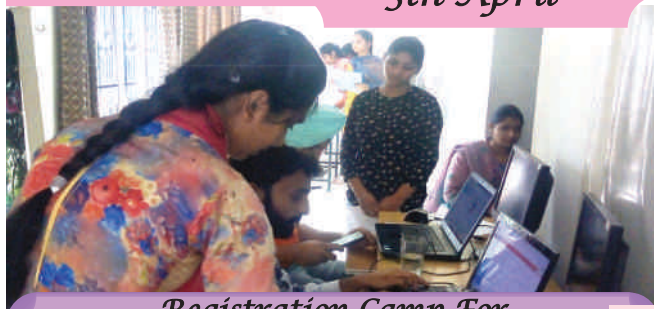
Registration Camp For Rural Area Students