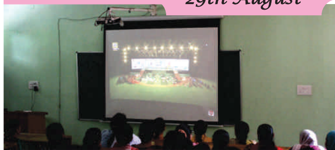
Live Telecast Of Fit India Movement