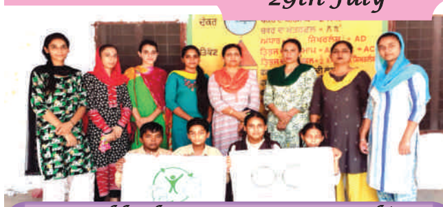
Swachh Bharat Summer Internship Programme For NSS Volunteers