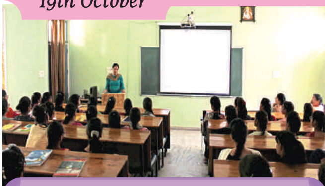
Seminar On AIDS Awareness