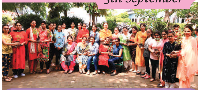
Teachers' Day Celebrations