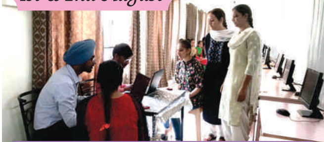
Registration Camp Under PMGDISHA