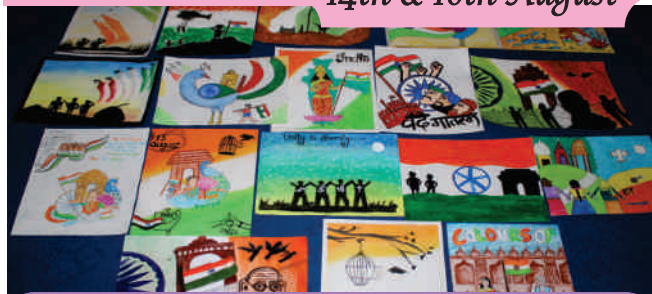
Poster Making, Collage Making And Photography Competition