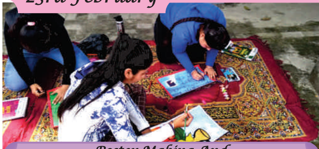
Poster Making And Slogan Writing Competition