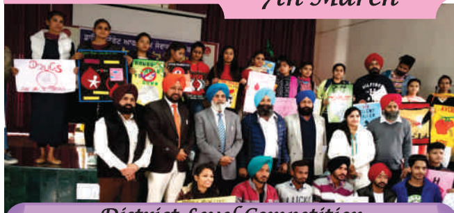
District Level Competition Among Red Ribbon Club