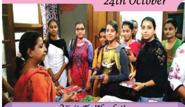
Visit To 'Ibadat' - A School For Special Children