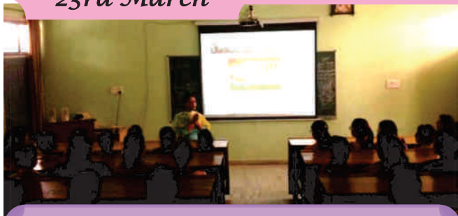
Youth Empowerment Day