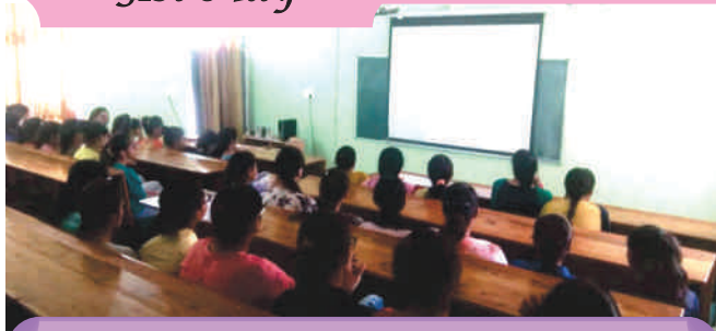
World No Tobacco Day