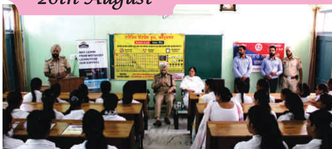
Seminar On Traffic Rules