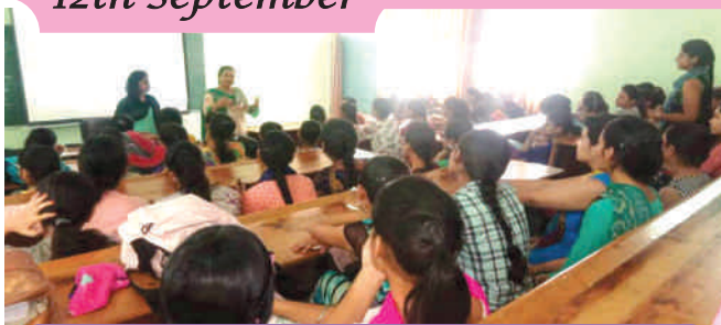
Discussion Session On Say No To Plastic