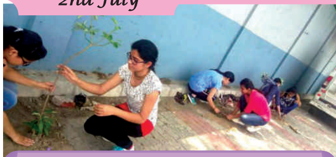
Tree Plantation Drive