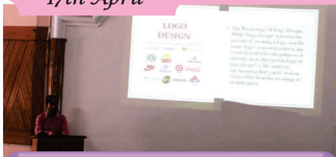
Digital Training Camp