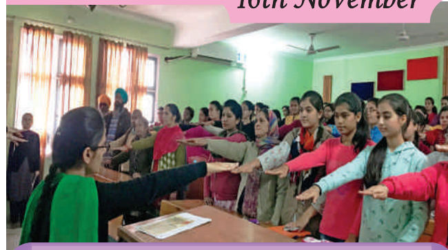
Jal Bachao Sankalp