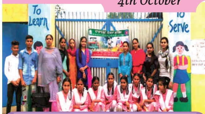
Awareness Regarding Stubble Burning