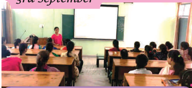
Seminar On Water Conservation