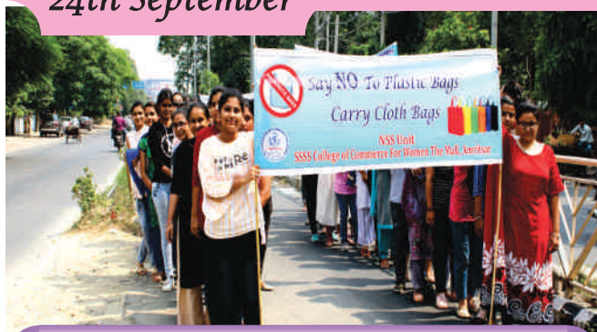
Awareness Rally On NSS Day