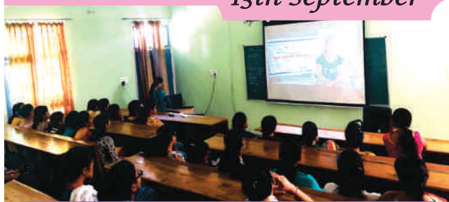
Documentary On Water Conservation