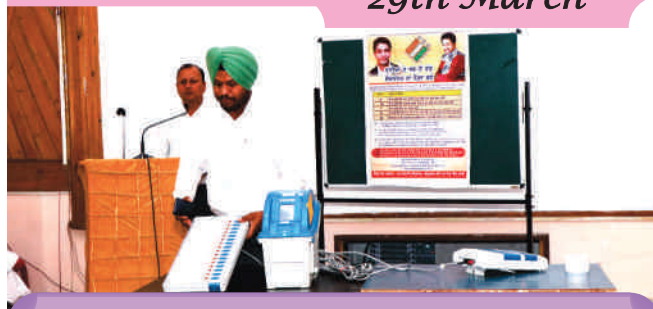
Talk On Right To Vote