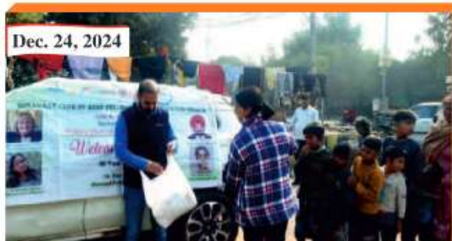
Spreading Comfort in the Cold: Project Warmth