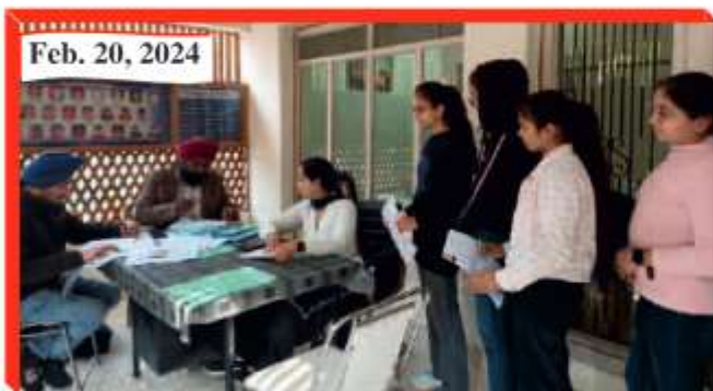
Driving License Camp