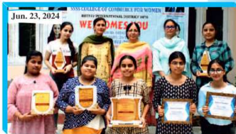
Recognizing Excellence: Rotaract Club Wins Prestigious Awards