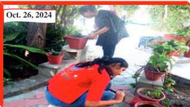
Fostering Cleanliness Awareness