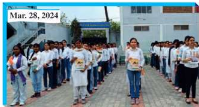
Martyrdom Day Commemoration