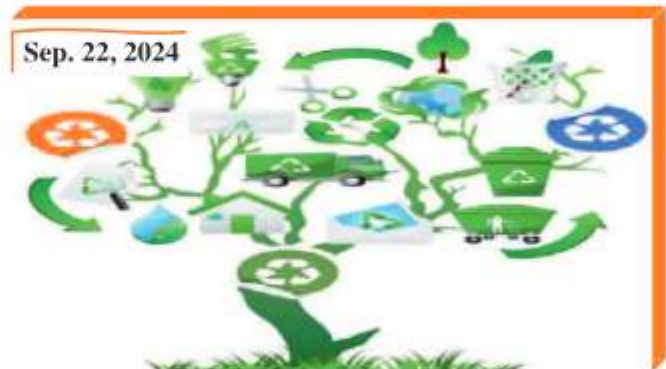
Eco-Friendly Campus Workshop