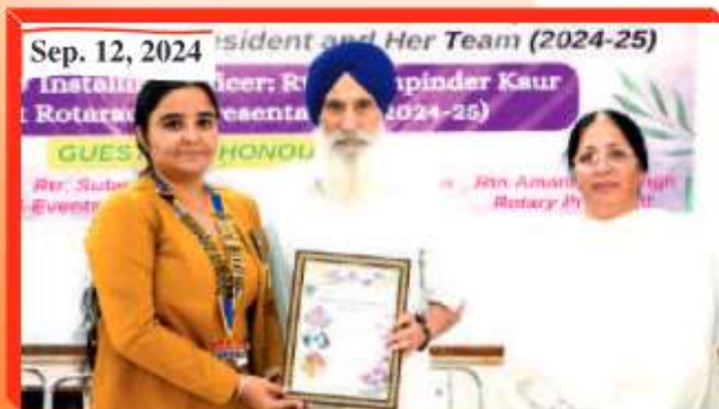
New Beginnings: Rotaract Club Installation Ceremony