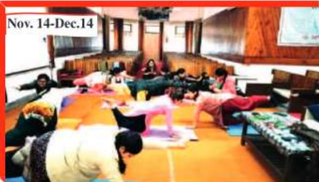
Stretch, Breathe, and Connect: Faculty Yoga Retreat