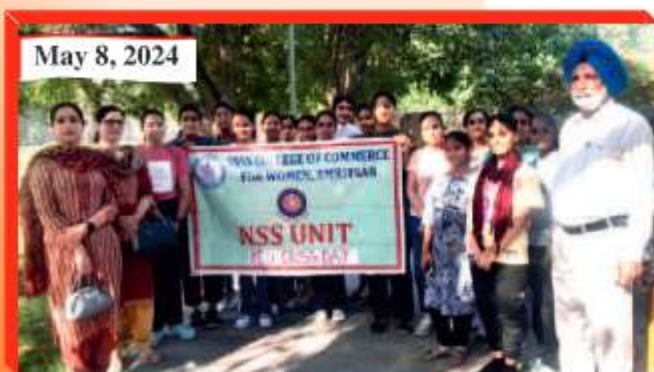
World Red Cross Day Celebration