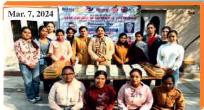
Mahashivratri Celebration by Rotaract Club