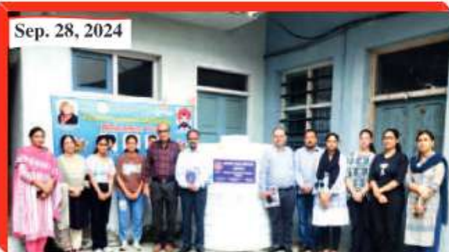
Supporting Water Conservation: Rotary Club Donates Water Tank