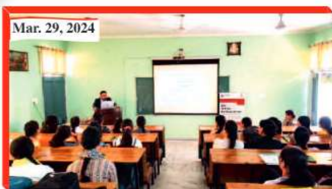
Workshop on E-waste Management