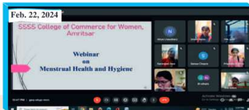
Interactive Session on Menstrual Health