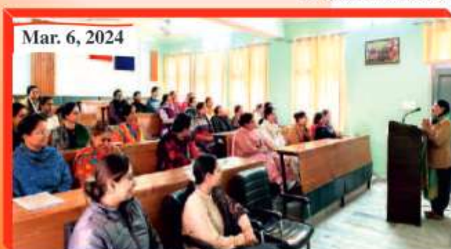
Seminar on Ensuring Mental Well-being