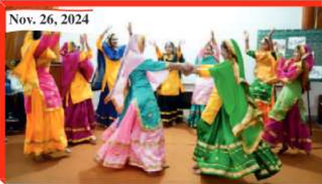
National Integration Day