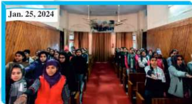
National Voter's Day Celebration