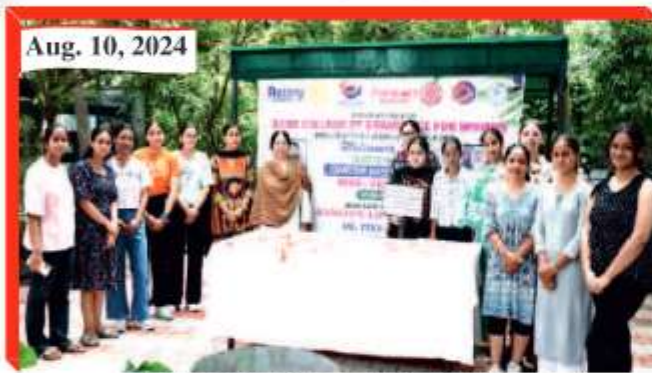
A Heartfelt Gesture for Soldiers: Raksha Bandhan Celebration