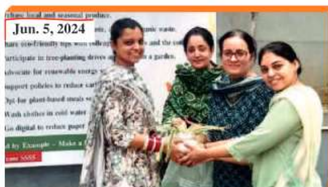
World Environment Day Celebration