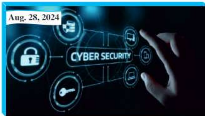
Webinar on Cyber Security