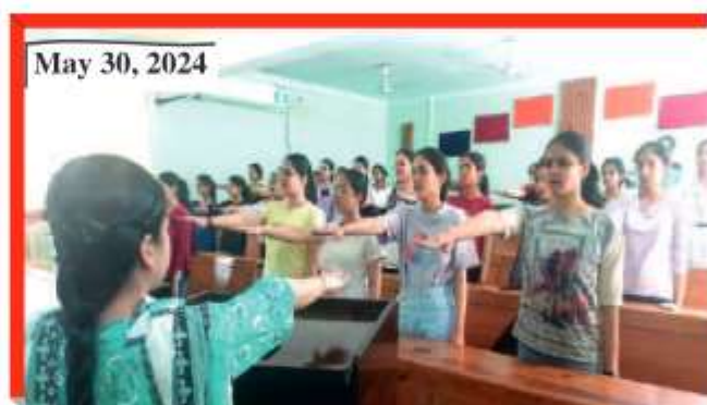
World No Tobacco Day