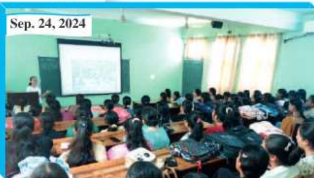
NSS Day Celebration